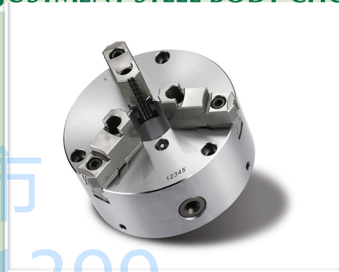
規格表 » Specifications